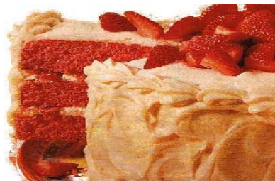
STRAWBERRY & CREAM CAKE

It is a beautiful three-layer cake with the consistency of a carrot cake, but with the flavors of bananas and pineapple and held together by a delectable Cream Cheese Frosting -- yum!