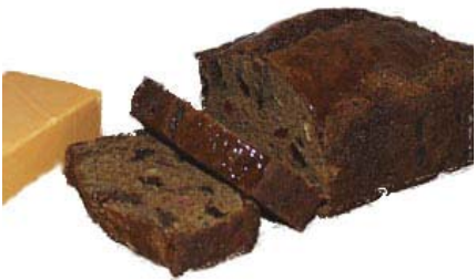
JAMAICAN EASTER BUN