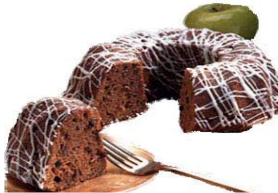
APPLE-BRANDY POUND CAKE