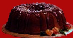
JAMAICAN CHRISTMAS CAKE